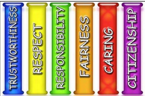
Tuesday, November 24th Citizenship Character Counts Awards